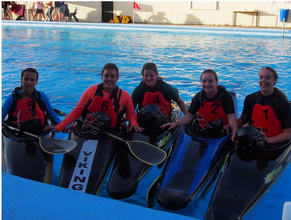
Senior Girls' Canoe Polo Team