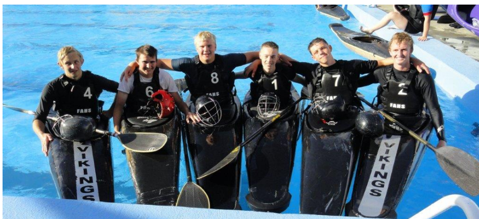
Senior Boys' Canoe Polo Team