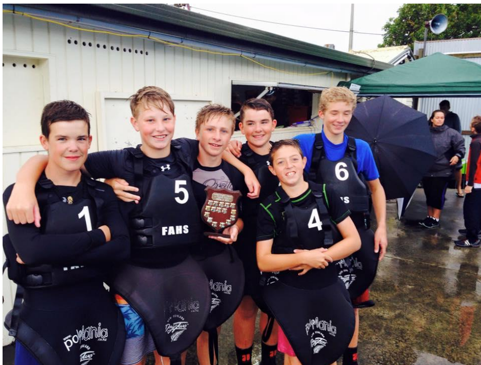
Junior Boys' Canoe Polo Team – National Champions